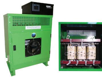
75kVA E-Saver OPAL™ Series shown with Cyberhawk TX™, hinged door and Rotatable IR Port™

Powersmiths guarantees that every transformer we manufacture meets our published technical data, and furthermore, that this performance is met over the full term of the 32-year pro-rated warranty. Being able to trust that savings are both real and long-term is part of why organizations choose Powersmiths.